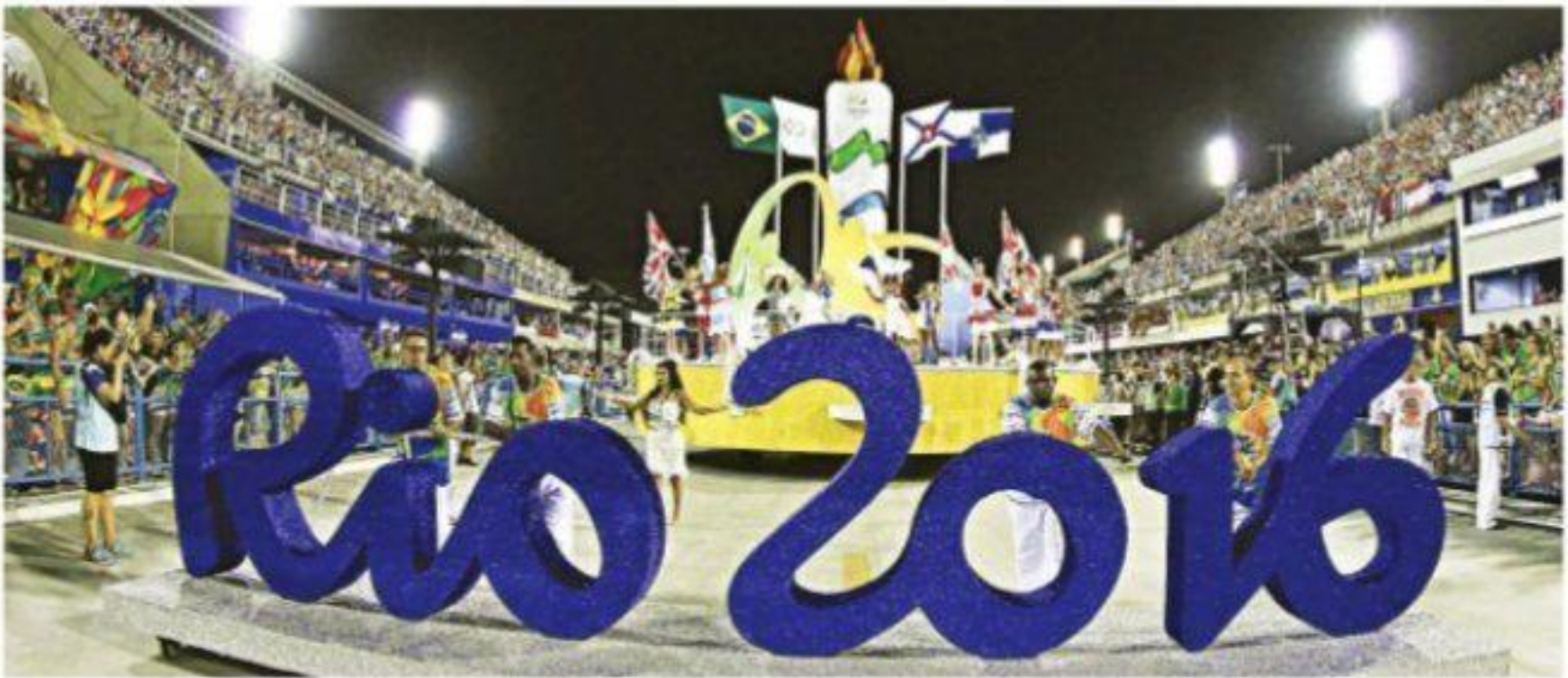
Rio de Janeiro will benefit immensely by staging the Olympics 2016

Apart from the logistics, sustainable transformation goals were set for this momentous event. As we all know, even bid-